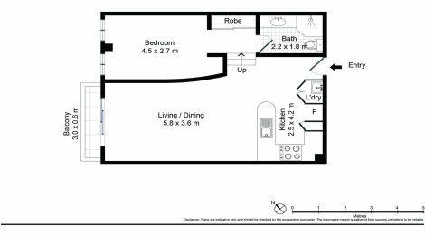
Unit 702, 71-75 Regent Street, Chippendale