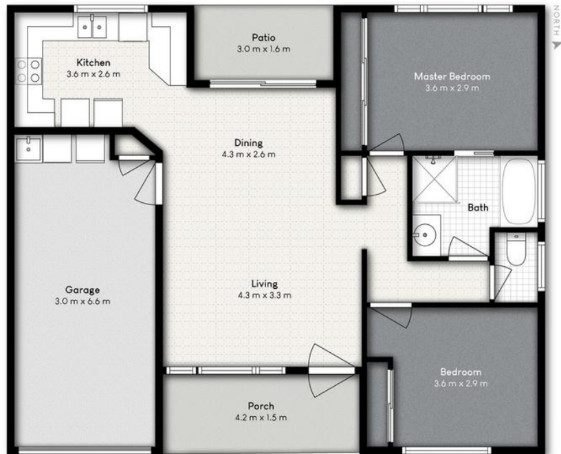
3/1-3 PAUL COURT, CARRARA