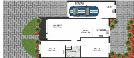
4/18-20 Nullaburra rd, Caringbah

All dimensions given are approximate & are for information only. Actual dimensions may vary. Please refer to the floor plan for more details.