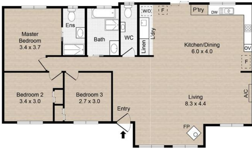
45 Callaghan Way, Capalaba 4157

Whilst every attempt has been made to ensure the accuracy of the floor plan contained here, measurements of doors, windows, rooms and any other items are approximate and no responsibility is taken for any error, omission, or misstatement. This plan is for illustrative purposes only and should be used as such by any prospective purchaser.