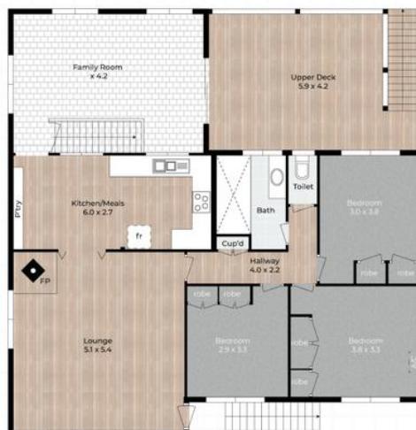
:: FLOOR PLAN First Floor