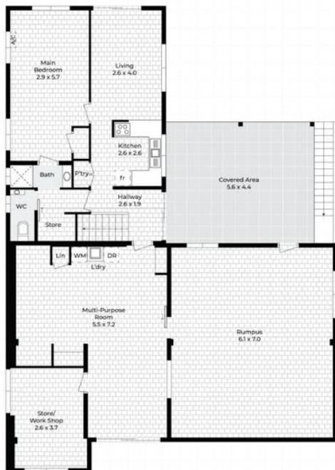
:: FLOOR PLAN Ground Floor