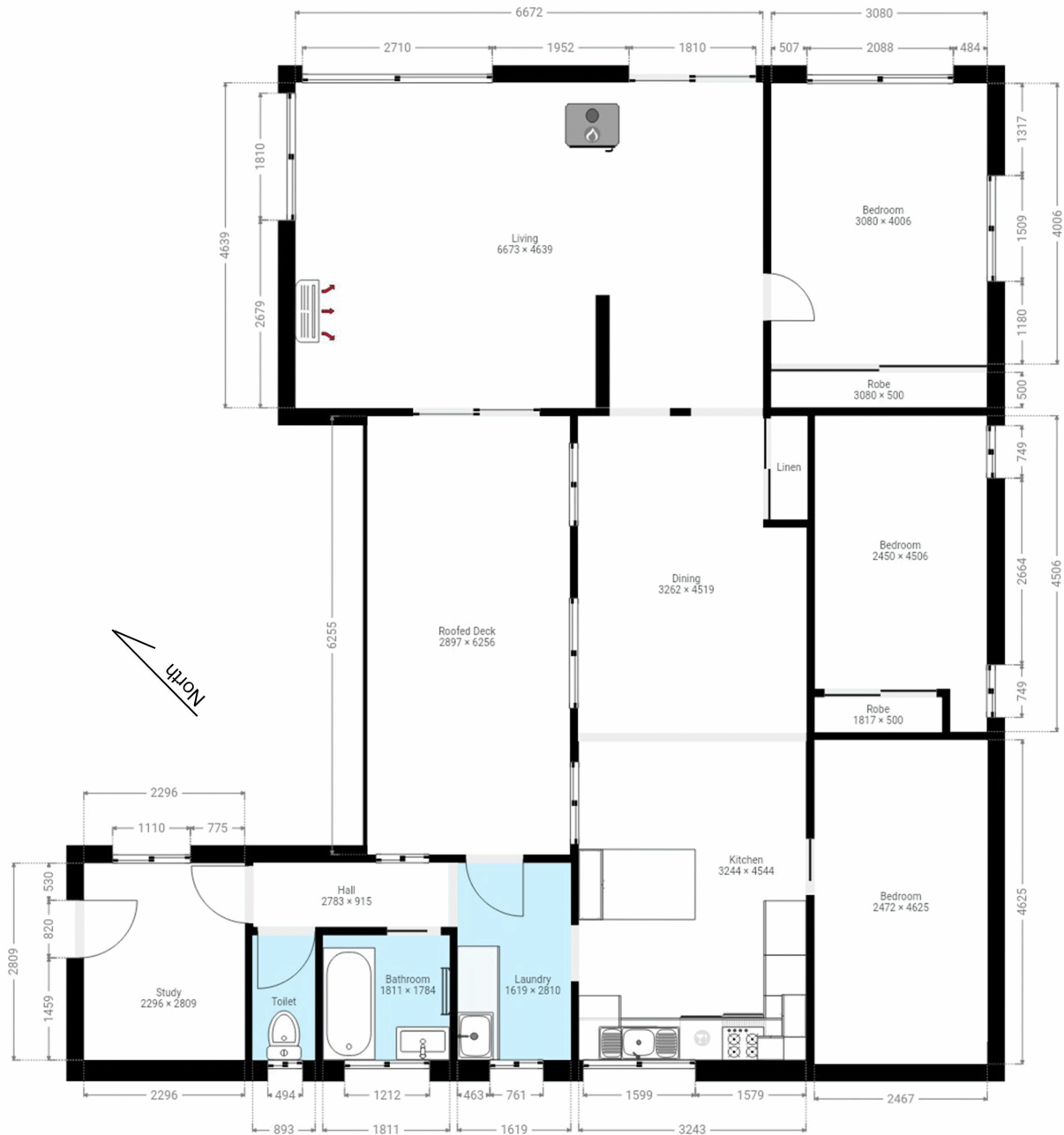
103 KEMPS LANE CANDELO

This plan is intended for marketing purposes only. All dimensions are approximate.