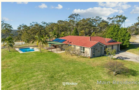
LJ Hooker Main Residence