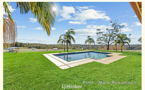
LJ Hooker Pool - Main Residence