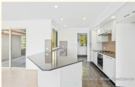
LJ Hooker Kitchen - Main Residence