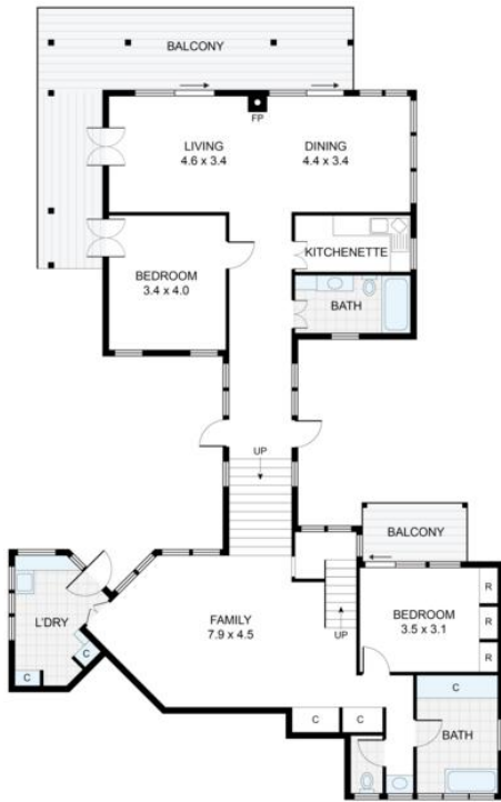
LOWER GROUND FLOOR : 155m 2