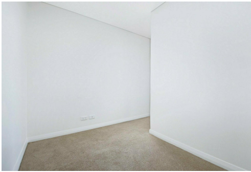
LJ Hooker Burwood