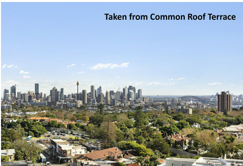
Taken from Common Roof Terrace