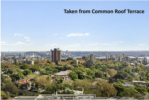
Taken from Common Roof Terrace