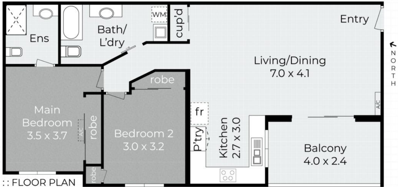
:: FLOOR PLAN