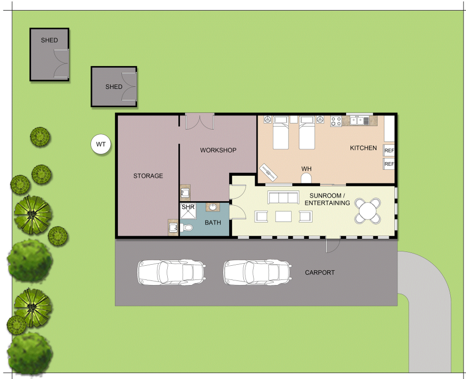
FLOOR PLAN ON SITE