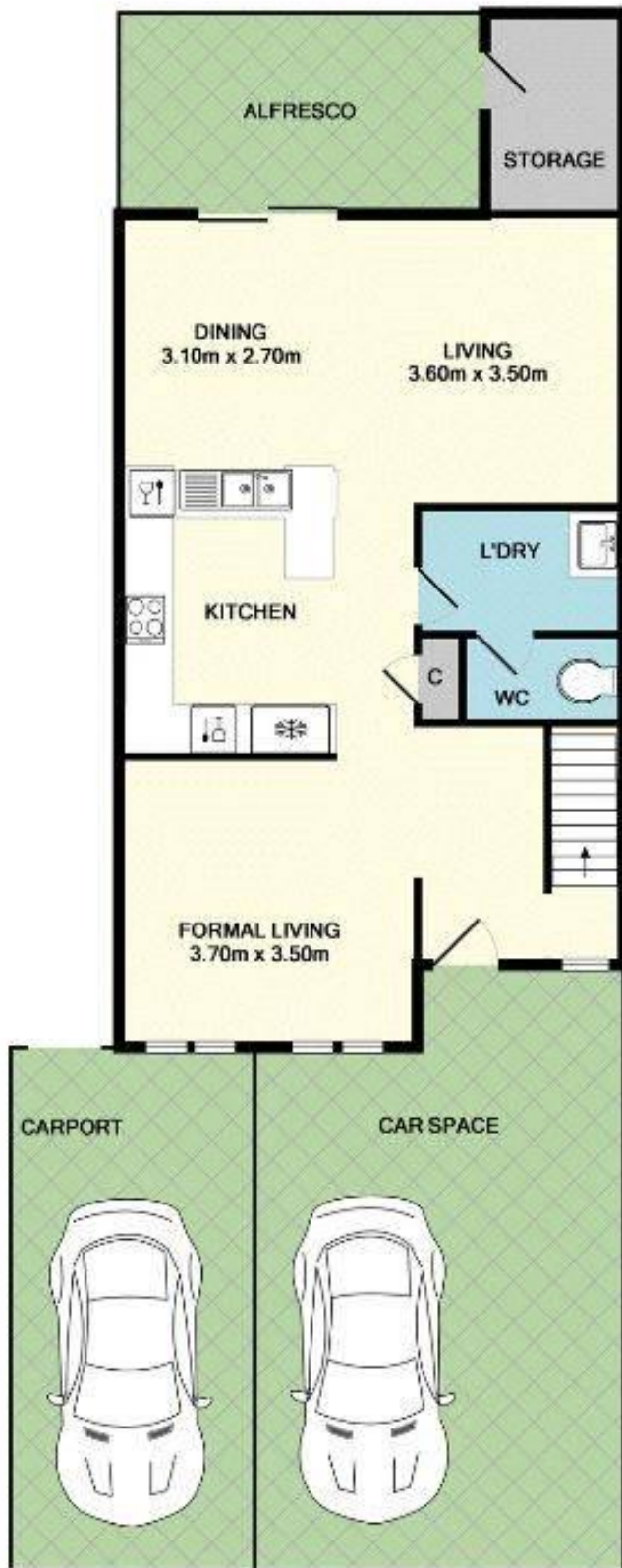
GROUND FLOOR APPROX. FLOOR AREA 66.8 SQ.M. (716 SQ.FT.)