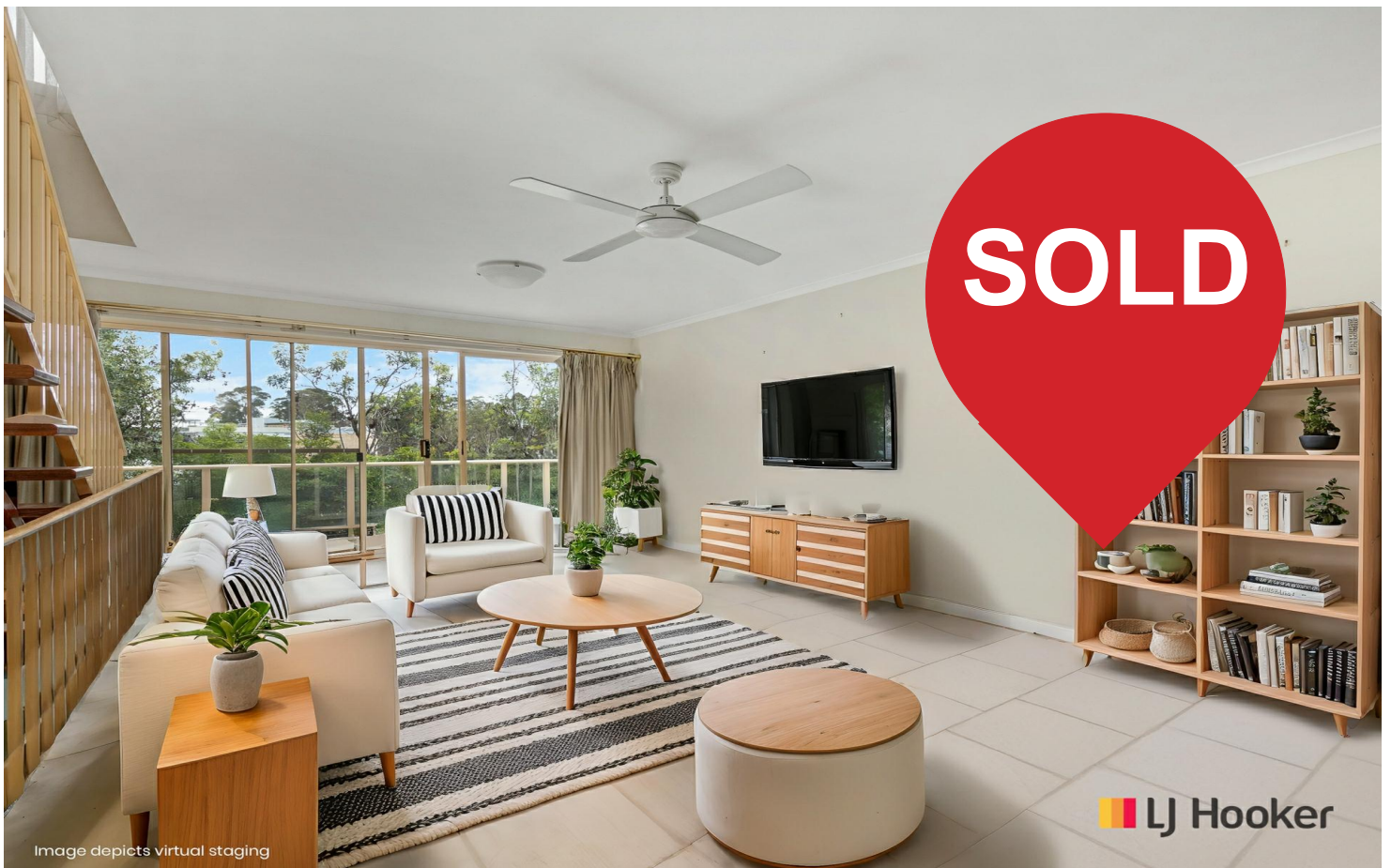
Image depicts virtual staging