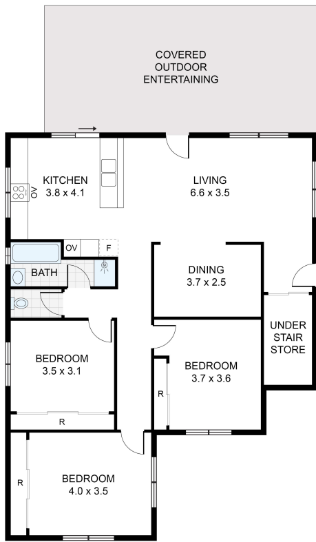
LOWER GROUND FLOOR : 123m 2