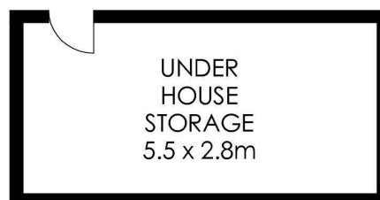
UNDER HOUSE STORAGE 5.5 x 2.8m

APPROX. INTERNAL AREA = 68 m 2 APPROX. EXTERNAL AREA = 24 m 2 TOTAL = 92 m 2 LAND SIZE = 1163 m 2