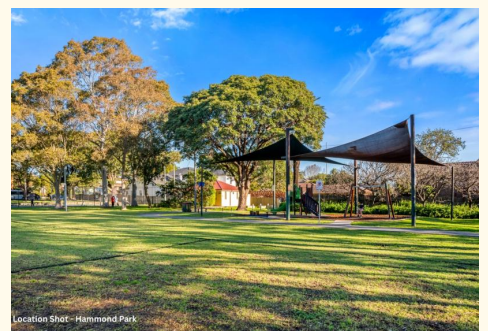
Location Shot - Hammond Park

All information contained therein is gathered from relevant third parties sources. We cannot guarantee or give any warranty about the information provided. Interested parties must rely solely on their own enquiries.