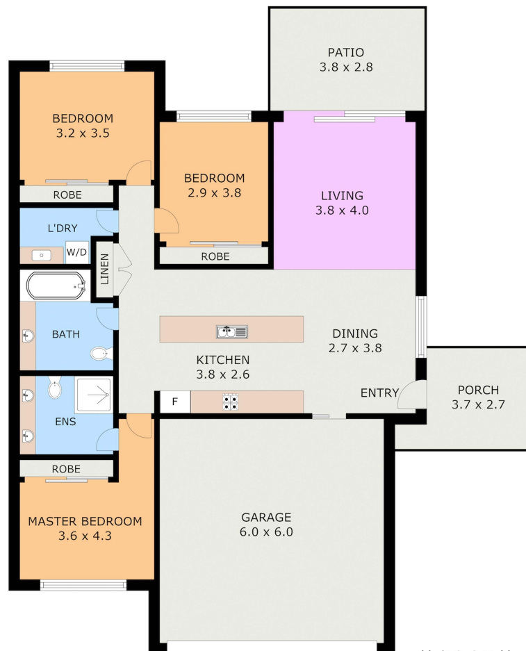
Unit 9, 241 Upper Dawson Rd, Allenstown