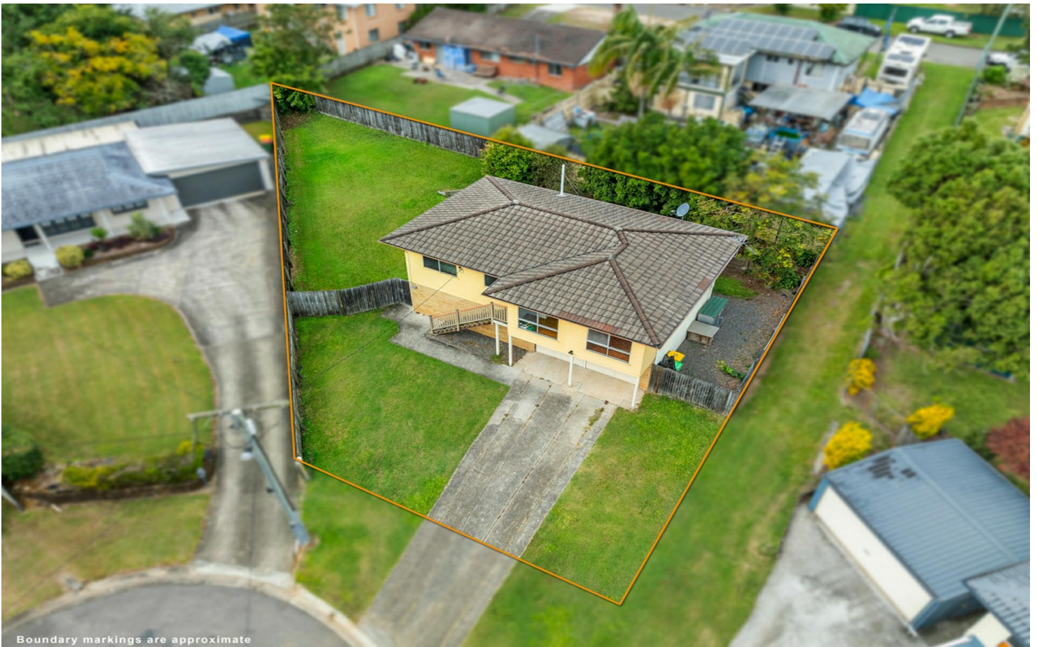
Boundary markings are approximate