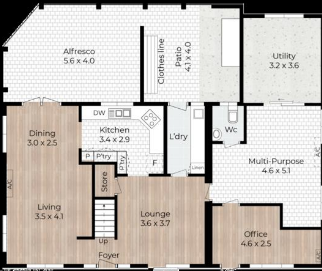
FLOOR PLAN Lower Level