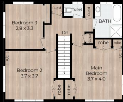
FLOOR PLAN Upper Level