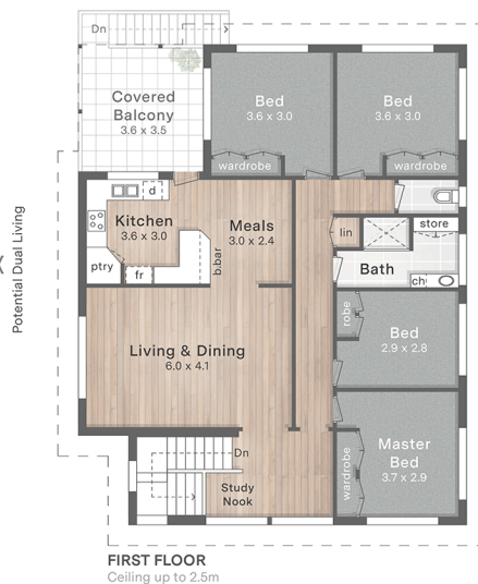
FIRST FLOOR Ceiling up to 2.5m