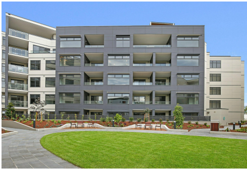
206/73 Flinders Street Wollongong