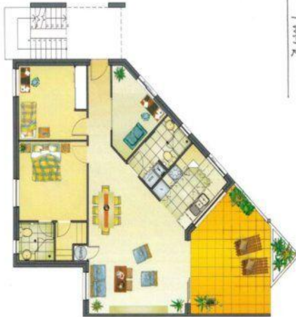
BUILDING B UNIT TYPE 1