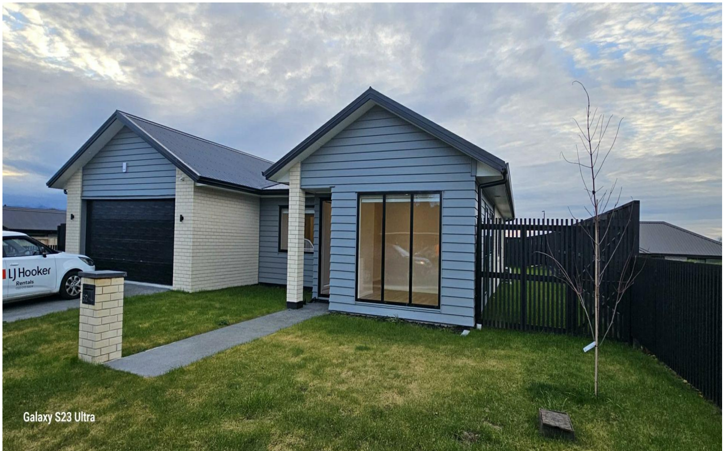
Galaxy S23 Ultra