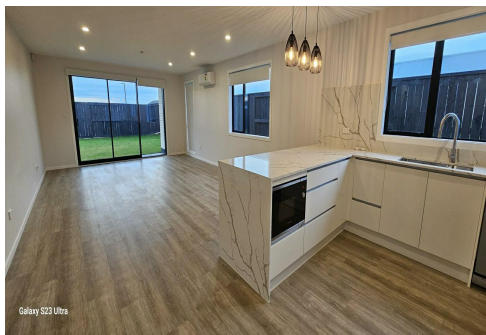
Galaxy S23 Ultra