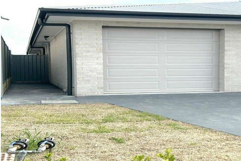
44A Dulcimere Street Tahmoor