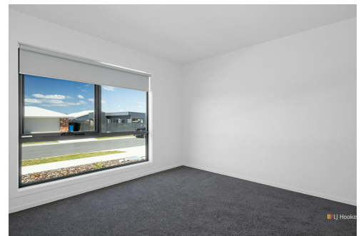
12 Damon Drive, Shearwater