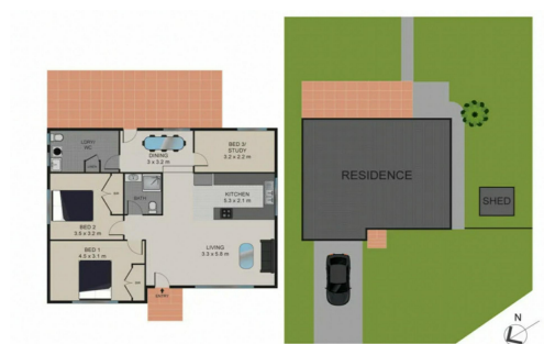
8 Station Street, Schofields