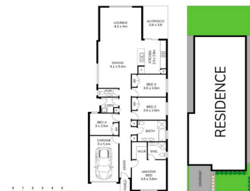
33 Hornet Street, Schofields

DISCLAIMER: DIMENSIONS ARE APPROXIMATE AND SHOULD ONLY BE USED AS A GUIDE. THEY ARE NOT TO SCALE AND RELIABILITY WILL BE ACCEPTED.