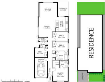
33 Hornet Street, Schofields