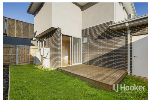
1/20 Steele Street, Newport