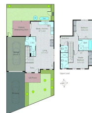
Image is for illustrative purposes only and does not represent the actual property.