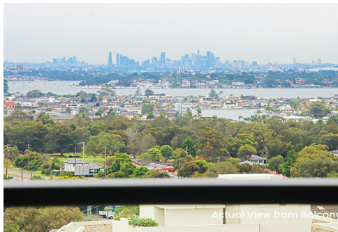
Actual View from Balcony