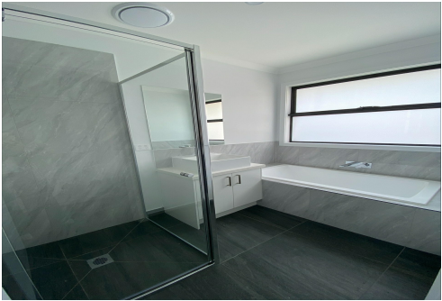
PHOTO ID REQUIRED AT OPEN HOMES. Every care has been taken to verify the accuracy of the details in this advertisement, however, we cannot guarantee its correctness. Prospective tenants are requested to take such action as is necessary, to satisfy themselves of any pertinent matter.