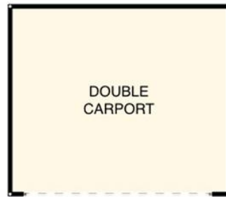
FLOOR PLAN INDICATIVE OF LAYOUT ONLY