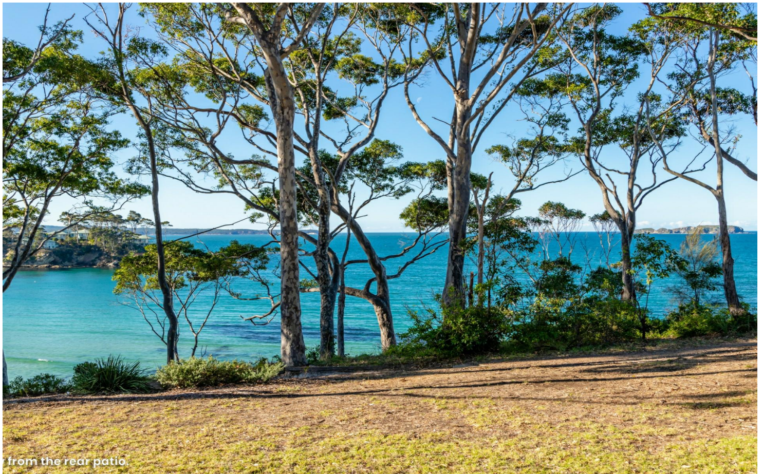
from the rear patio