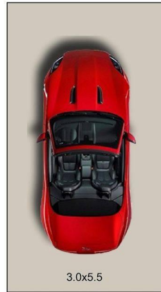
UNDERCOVER SECURE CARSPACE