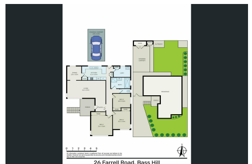
26 Farrell Road, Bass Hill