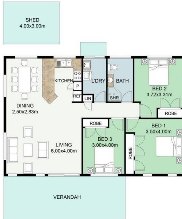
FLOOR PLAN 24 Bushland Drive, Banora Point