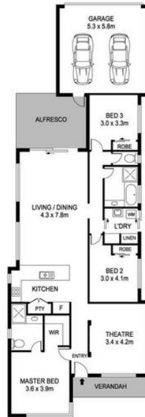
54 KOOTINGAL BEND, BALDIVIS

DISCLAIMER PLANS SHOWN ARE FOR MARKETING PURPOSES ONLY. ALL DIMENSIONS ARE APPROXIMATE AND NOT TO SCALE. THEY ARE SUBJECT TO ENDING AND INCONVENIENCES AND NO LIABILITY WILL BE ACCEPTED. INTERESTED PARTIES SHOULD MAKE THEIR OWN INQUIRIES.