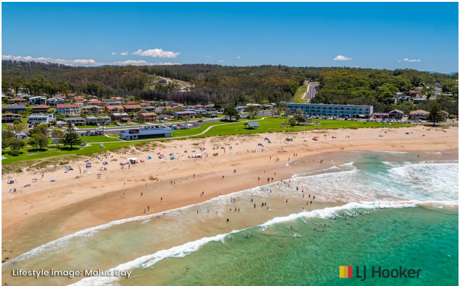
Lifestyle image: Malua Bay