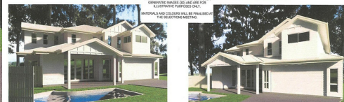
Scale in metres, indicative only. Dimensions are approximate. All information contained herein is gathered from sources we believe to be reliable. However, we cannot guarantee its accuracy and interested persons should rely on their own enquiries.