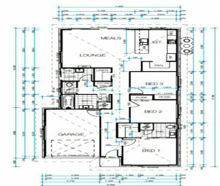
1:100 1 > GROUND FLOOR PLAN