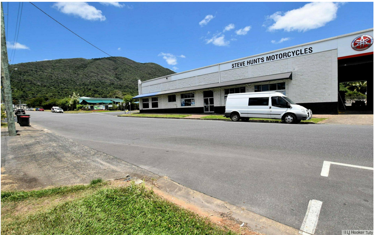
LJ Hooker Tully