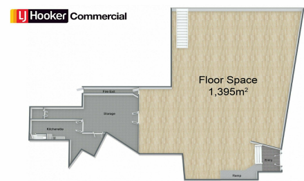
147 Queen Street, Campbelltown - Ground Level

Floor Plan produced by Grid Media Pty 0404 083 445 DISCLAIMER: THIS IS FOR ILLUSTRATIVE PURPOSES ONLY. ALL DIMENSIONS ARE APPROXIMATE AND DOES NOT CONSTITUTE A LEGAL DOCUMENT