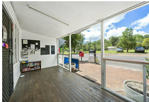
5 Scott Street, BENARKIN